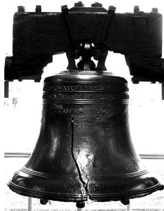
Visitors come to the Liberty Bell Center to see first-hand this icon of liberty and freedom.