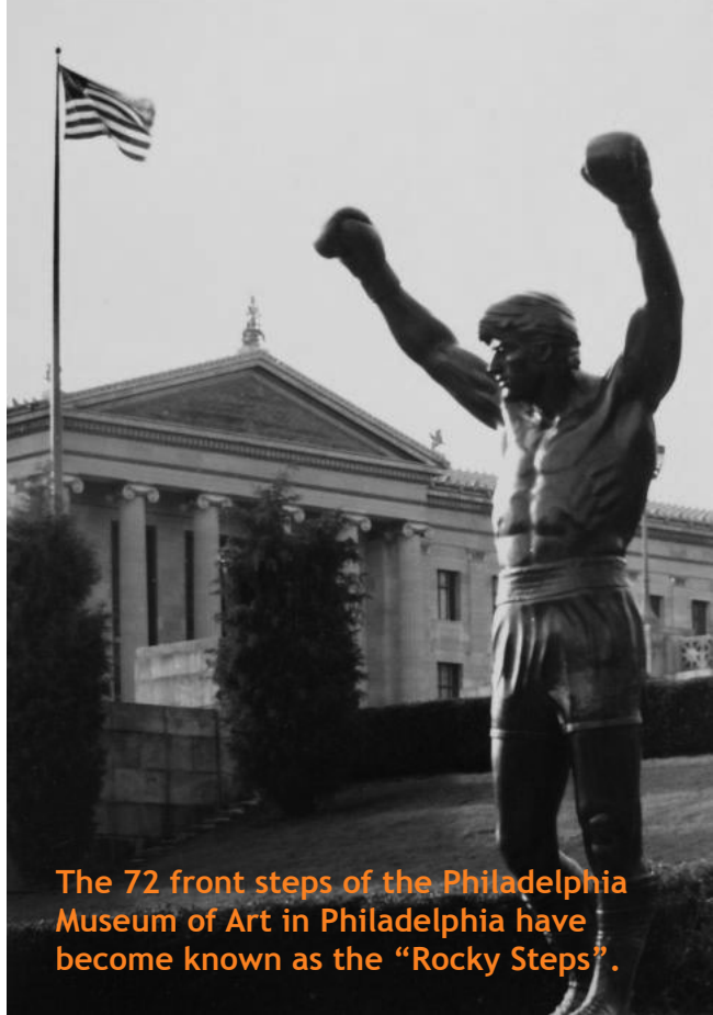
The 72 front steps of the Philadelphia Museum of Art in Philadelphia have become known as the "Rocky Steps".